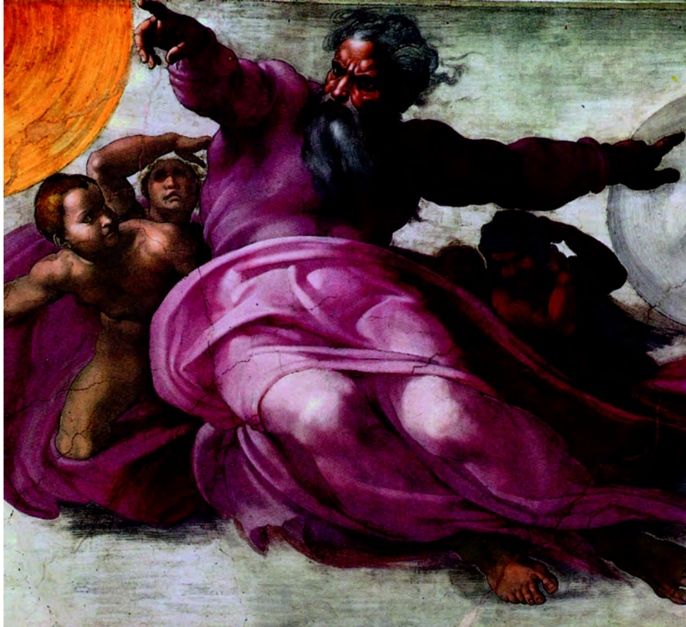
Figure 1. Michelangelo, 1475-1564: Creation of the Sun and Moon , 1511

An Old Testament KnoWhy 1 for Gospel Doctrine Lesson 3A: The Creation (Moses 1:27-42; 2-3) (JBOTLO3A)